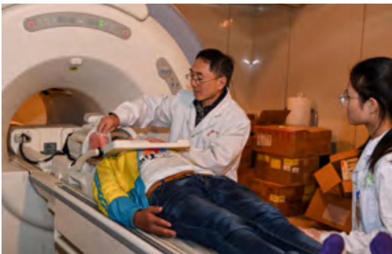
The students traveled from their homes in Shuiluo Township, Muli County, Liangshan Prefecture, Sichuan Province to a hospital in Xichang.

W hen humans ingest raw or undercooked pork infected with pork tapeworm larvae, adult tapeworms can develop in their small intestines. This human infection is called taeniasis. Each such infected human is a carrier for cysticercosis , which is caused by fecal-oral contamination from the carrier. Cysts may develop in skeletal muscles (often), the central nervous system (location that most frequently causes serious symptoms), or less frequently in the eyes, skin, or heart. In the central nervous system (most commonly the brain), the disease is called neurocysticercosis.