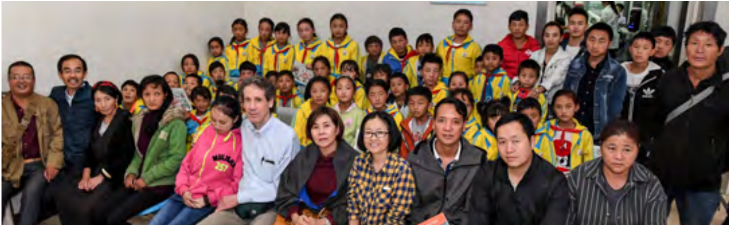
In October 2017, BLSCP provided $21,000 for MRI brain scans for 44 Tibetan primary school students whose blood had tested positive for NCC. Nine students had brain cysts and received drug therapy.

blindness, and death. The risk factors for this preventable disease are lack of education, free-ranging pigs, lack of meat inspection, a poor economy, eating undercooked pork, lack of latrines, poor hygiene, and lack of trained doctors.